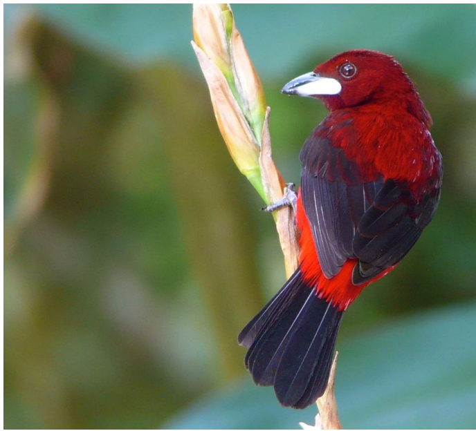
Crimson-backed Tanager

with flowers and shaded by open groves of trees, while nearby hillsides are covered in secondary forest. Birds are abundant in this patchwork of habitats. We will make our way through the bustling little town en route to the Canopy Lodge, our home for the next five nights.