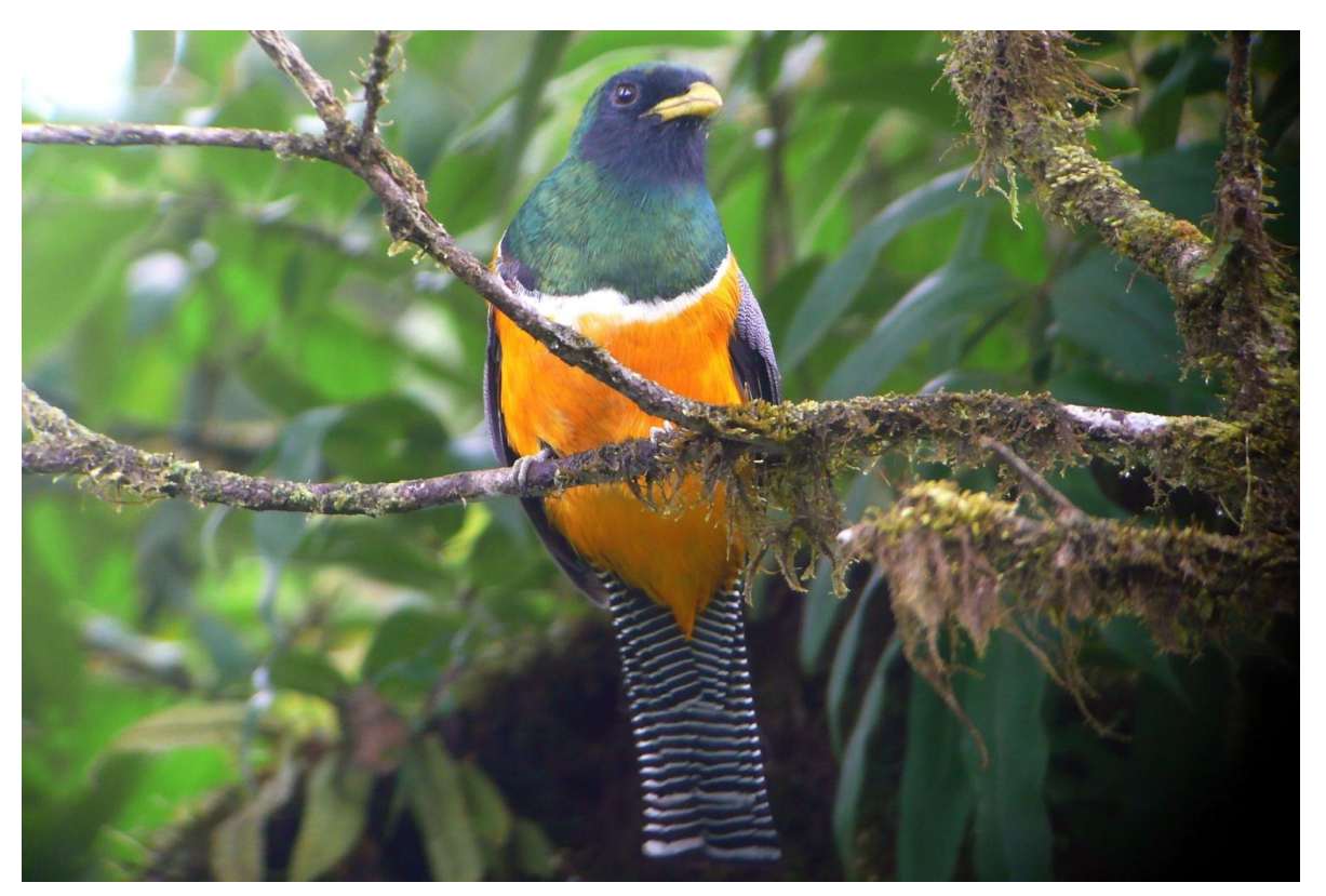
Orange-bellied Trogon © Barry Zimmer

Straddling the Continental Divide, the foothills of Panama harbor a unique avifauna that includes both lowland and highland species, as well as birds of both the Pacific and Caribbean slopes. Our tour, designed to pick up where traditional Canal Zone tours leave off, offers some of Central America's most exciting birding, set amidst beautiful middle-elevation forest and in a refreshingly moderate climate.