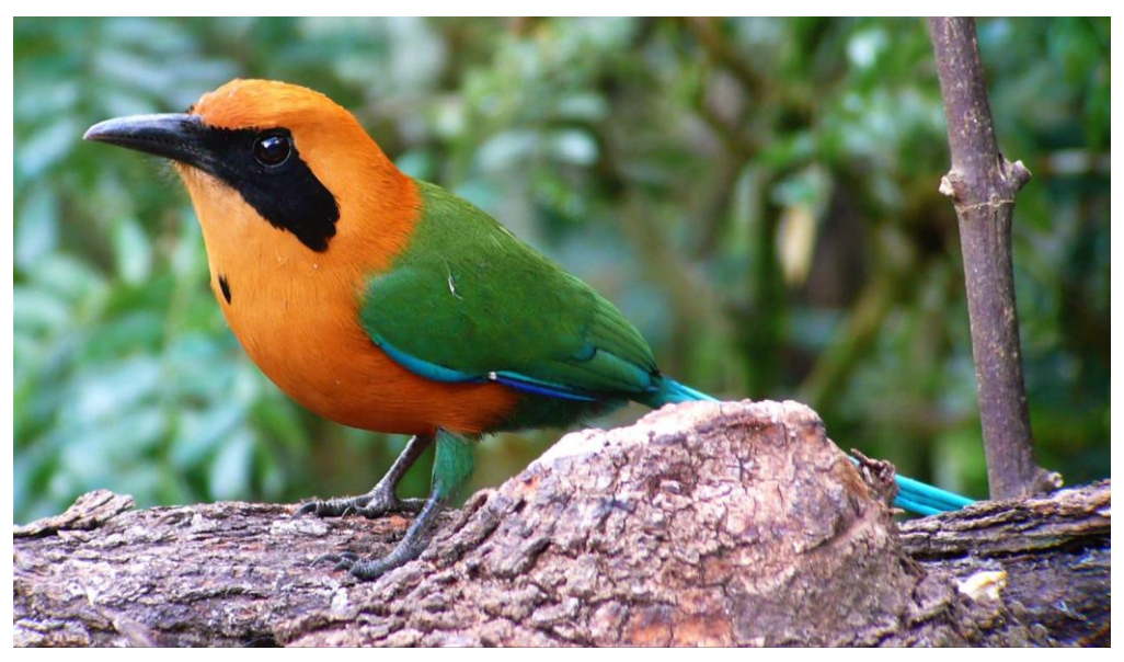
Rufous Motmot

Among the many species that visit the garden and feeders are Gray-cowled Wood-Rail; Rufous Motmot; Collared Aracari; Red-crowned Woodpecker; Clay-colored Thrush; Crimson-backed, Flame-rumped, Bluegray, Palm, and Dusky-faced tanagers; Red-crowned Ant-Tanager; Bananaquit; Red-legged Honeycreeper; Orange-billed Sparrow; Buff-throated Saltator; Thick-billed Euphonia; and Chestnut-headed Oropendola (a colony of which sometimes nests on the hillside above).