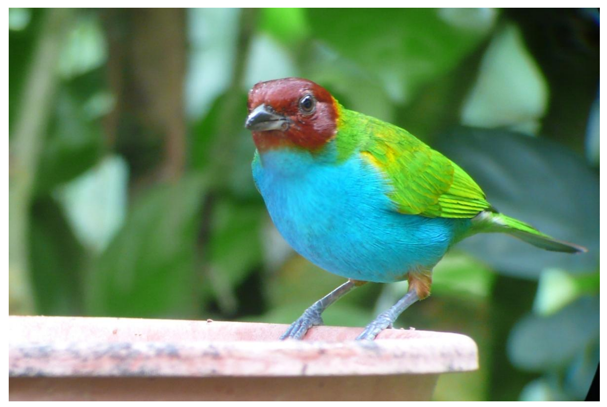
Bay-headed Tanager

This area is home to some fantastic foothill birds not found in the forests below or the Canal area. Among these, tanagers are the dominant group with potential for gems like Emerald (scarce), Bay-headed, Silver-throated, Golden-hooded, and Tawny-crested tanagers; Tawny-capped Euphonia; and Scarlet-thighed Dacnis.